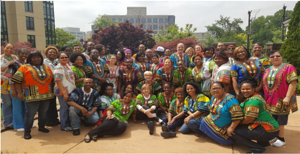
“Staff of Lisner-Louise-Dickson-Hurt Home”